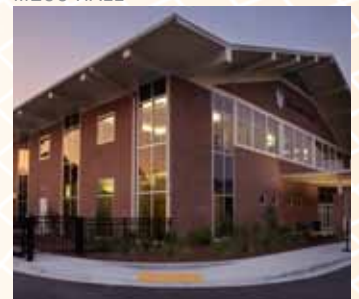
JACKSONVILLE COUNTRY DAY SCHOOL