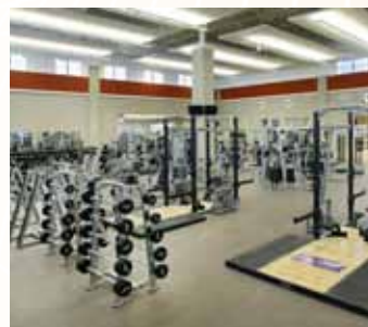
MAYPORT FITNESS CENTER