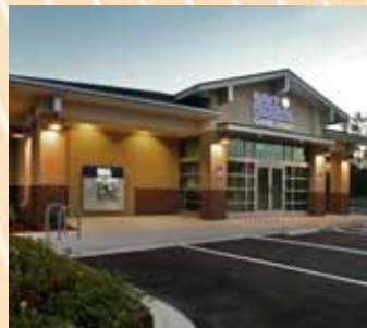
NAVY FEDERAL CREDIT UNION