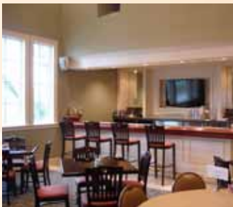
CATERING AND CONFERENCE CENTER