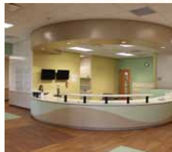
MAYPORT CHILD DEVELOPMENT CENTER