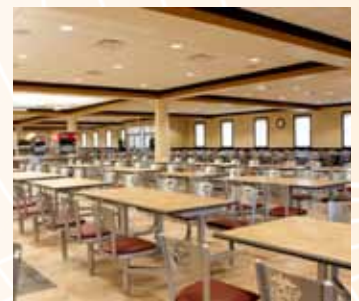
OFFICER CANDIDATE SCHOOL MESS HALL