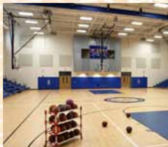
PALMER CATHOLIC ACADEMY