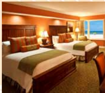
PONTE VEDRA INN & CLUB