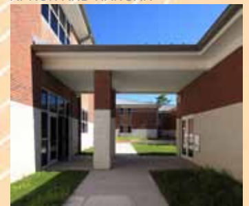
CONSOLIDATED ACADEMIC FACILITY