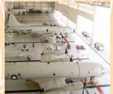
NAS JACKSONVILLE PARKING APRON AND HANGAR