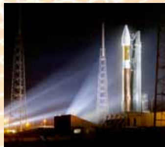
ATLAS V LAUNCH COMPLEX