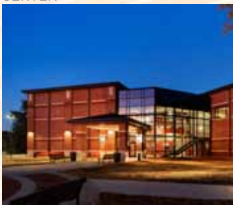
NATIONAL CENTER FOR TRAINING & RESEARCH