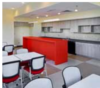
CANCER SPECIALISTS OF NORTH FLORIDA

We are committed to providing construction services that deliver superior performance and value.