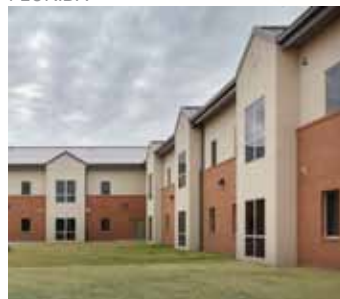
MARKET-STYLE BACHELORS QUARTERS